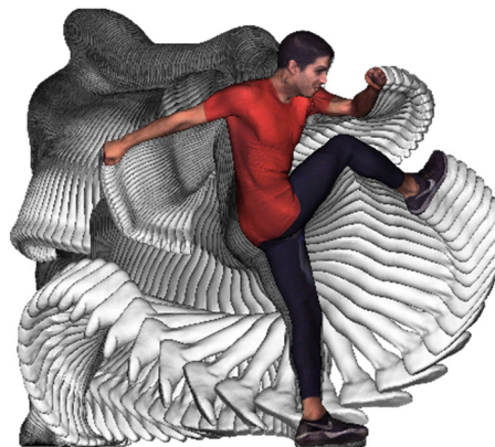
Figure 2: Example of MOVE4D free kick motion capture at 90 fps

Keywords: Digital anthropometry, temporal scanning, 4D, human motion, markerless, motion analysis, image processing, 3D body model, shape, pose, template-fitting algorithm, homologous mesh, deep learning, machine learning.