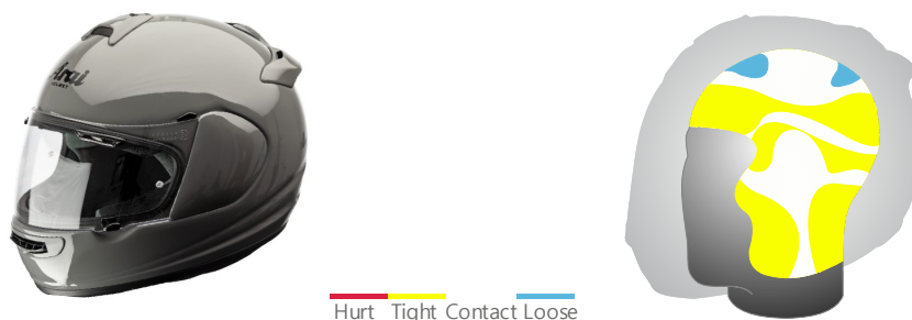
Figure 3. The color map illustrating the process of choosing the best fitting helmet

The scanner provides a database of the internal surfaces of a helmet. The proposed algorithms for scanning the inner surface of a helmet allow to create an accurate map of the inner surface of a helmet, as well as a map of the firmness of the surface of a helmet. Moreover, these maps are created with consideration of subsequent positioning of the helmet on a head based on the analysis of the positions of key points, which then, along with the obtained three-dimensional models of the shape of a helmet, are used in the service of selecting the best fitting helmet and its adaption (fig. 3).