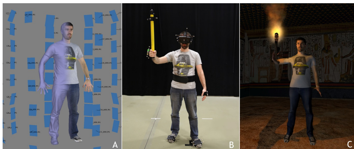
Fig. 3. A) Post-processed 3D scan, B) VR setup, C) View from the 3D game engine.

Two demonstration scenarios using this VR platform were developed showcasing different use cases of 3D scans in virtual reality environments. The setup was installed in our motion capture studio allowing the users to navigate in a 6 x 6 meters space.