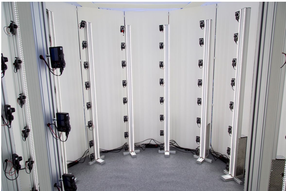
Fig. 1. Photogrammetric 3D scanner consisting of 96 Canon Powershot A1400 cameras

The cameras were running the Canon Hack Development Kit [18] (CHDK), an open-source alternate firmware allowing each camera's parameters and tasks to be controlled by a LUA script. In addition, the USB extension chdp-ptp [19] was used to remotely control the cameras from a single computer, trigger synchronized shoot and automatically download the pictures to the computer. This allowed the scanner to be controlled by a simple user interface. The synchronization mechanism was software only which resulted in a maximum sync error of about 100 ms. This can be considered as sufficient for scanning people standing in a specific position. Better synchronization could have been achieved by using a more complicated hardware sync mechanism [20] but this solution was not implemented in our application. Users were asked to stand in an A pose (arms inclined at roughly 45°), which facilitated the post processing of the 3D scan at a later stage of the pipeline (see template fitting below).