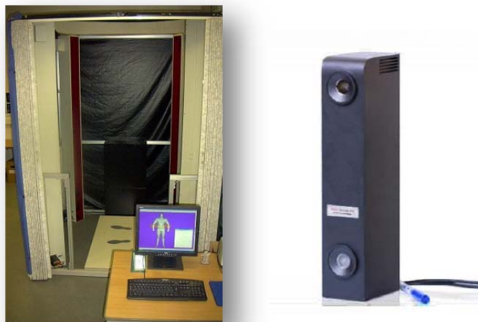
Figure 2. L: Hamamatsu BLS Scanner R: Artec L portable scanner.