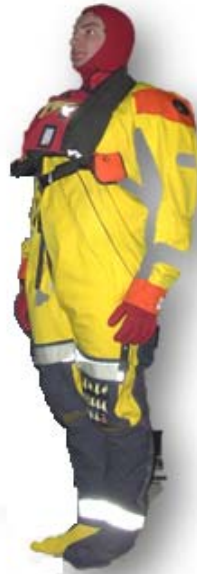
Figure 1. A study volunteer wearing survival suit and re-breather.

Forty four healthy males aged 31.2 \pm 12.2 y with body mass index 26.2 \pm 4.4 kg.m -2 were recruited from the University and local community. All participants were measured for stature and mass, and provided with a survival suit (500 series Helicopter passenger survival suit (Survitec group, Birkenhead, UK) according to the manufacturer's size guideline, and illustrated in figure 1.