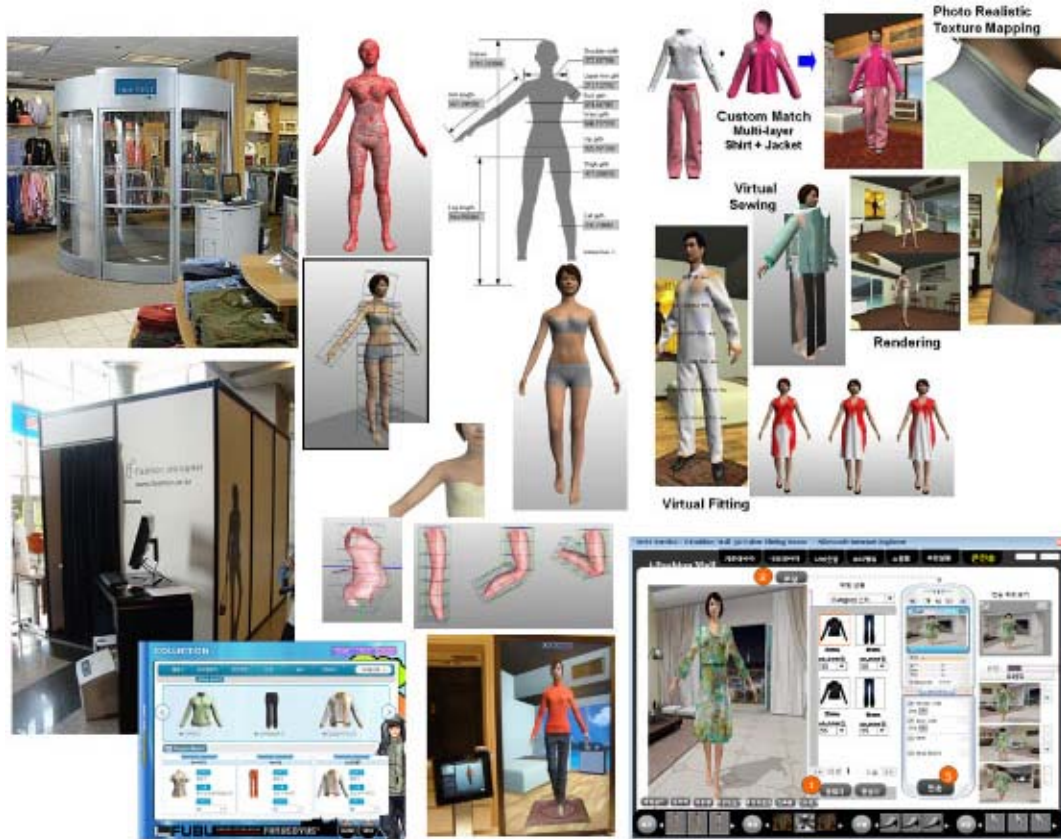
Fig.1. Digital fashion service for apparel shopping.