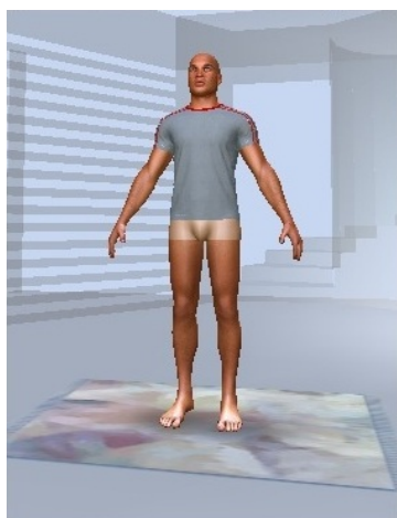
Virtual Simulation Using Fabric One Properties

Figure 3 displays the derived properties for two selected textile materials used within the virtual simulation. Fabric One is a weft plain knitted structure (87% polyester / 13% Spandex) with a mass of 190g/m 2 and Fabric Two is a 100% polyester microfibre woven structure with a mass of 82g/m 2 .