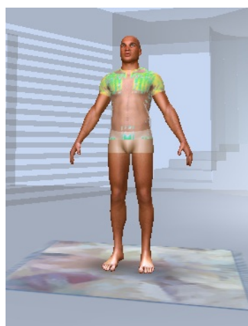
Pressure Simulation Using Fabric Two Properties