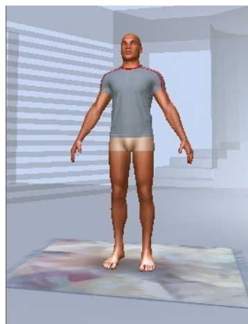
Virtual Simulation Using Fabric Two Properties