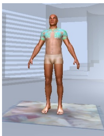
Pressure Simulation Using Fabric One Properties

Using a basic T-shirt from the Vstitcher library the garments were simulated using the different textile properties. The resultant simulations are displayed in Figure 4 – it can be seen from the virtual representation that although the fabric properties are vastly different the simulation appears to be very similar. However, if a pressure map function is applied to the avatar, the effects of the different textile material properties in relation to the human form can be seen clearly (Figure 5). The woven structure (Fabric Two) demonstrates area of high pressure (yellow and green); whilst the knitted structure (Fabric One) demonstrates areas of significantly lower pressure around the arm, shoulder and waist areas (green, blue, white).