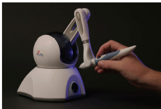
Fig. 1: The used force feedback system Phantom® Omni™ and FreeForm® Concept™, SensAble Technologies, USA

Keywords: breast, 3-D surface imaging, breast surgery, force feedback, surgical planning